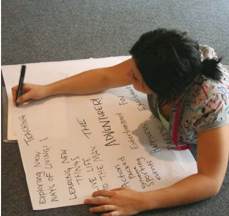
Flexible Learning Options (FLO) in the South

education, from family problems to alcohol and drug abuse. Most are very small in scale, but good pointers to how the education system could better engage teenagers. For example, Tjinatjunanyi – Footprints to Freedom – is an ICAN project which is helping over a dozen local Aboriginal teenagers in the Davenport community near Port Augusta. The program, which is a collaborative effort between the state government and the Uniting Aboriginal and Islander Christian Congress, operates from a community centre, and provides a mix of literacy and numeracy classes and a day per week on cultural activities. Learning is supported by providing a healthy breakfast and lunch and regular physical activity. There's a strong emphasis on making the classes culturally relevant and involving families and the community. Each student has a mentor who provides personal support and encouragement as well as serving as a role model. Many