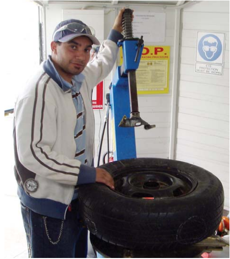
Upper Spencer ICAN

As South Australia's economy picks up after a period of relatively slow growth the state will need not only more trained nurses, carers and other health workers to provide support for the growing population of elderly people but also more trained mechanics, engineers, planners and technicians in the growing mining and defence industries. Attracting skilled migrants is one way to meet these demands, but South Australia will be competing with other states and other countries for such people. The long-term priority therefore has to be improved education and training for people born and brought up in the state.