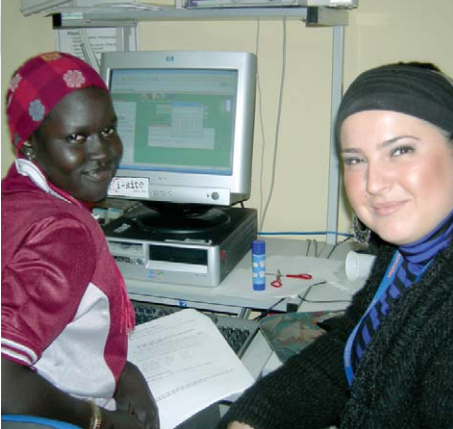
North Western ICAN