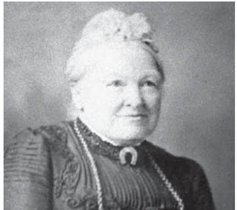
Catherine Helen Spence. PP 2681, Photograph from State Children in Australia by C.H. Spence

But structural conditions only take us so far. Even a cursory view of the history shows the vital importance of three less structural factors. One is political leadership : innovation has peaked in the state when dynamic political