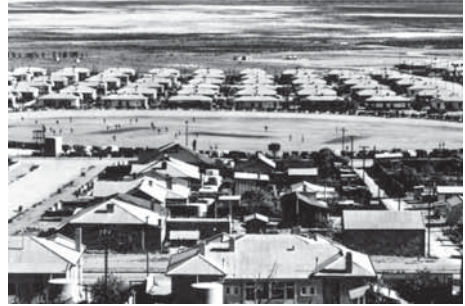
Housing Trust Homes Whyalla c1950